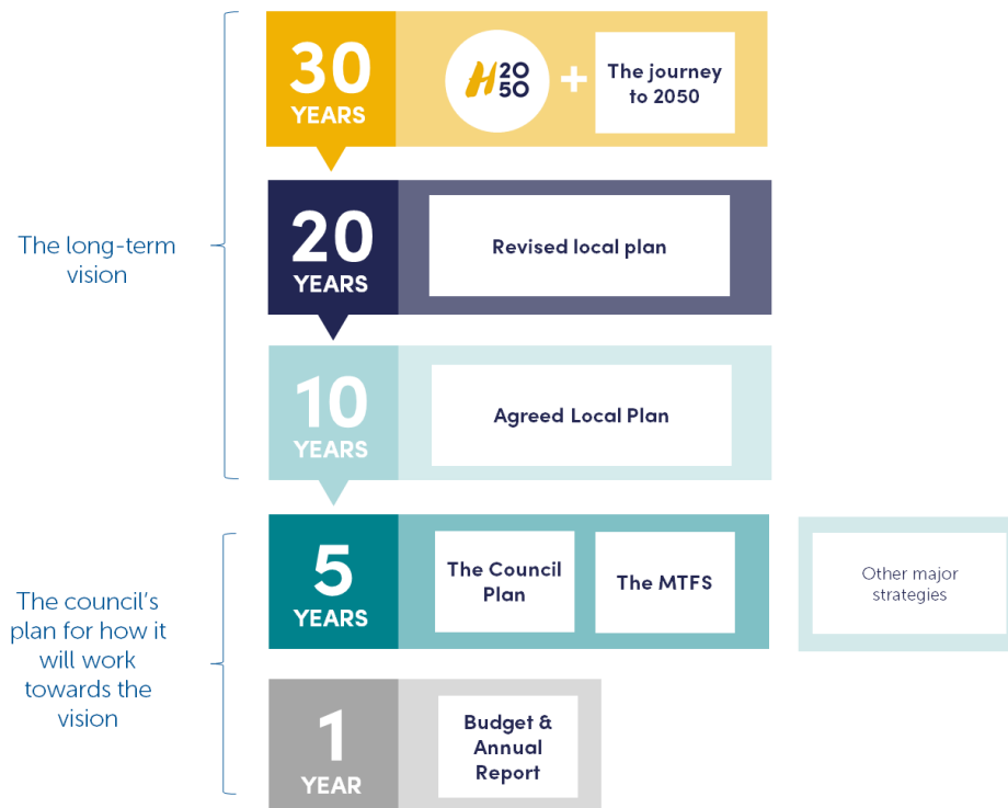
Figure 1: Horizon 2050 vision in the context of policy and strategy