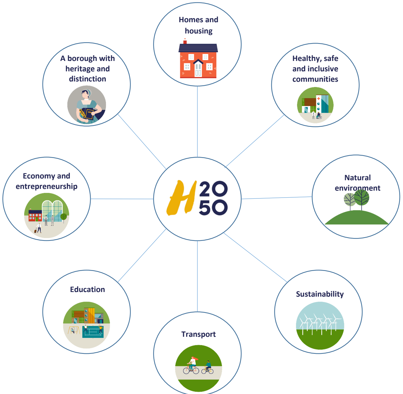
Figure 4: Horizon 2050 vision themes

themes are equally important and there are overlaps between them. The full vision text is available at Appendix 1.