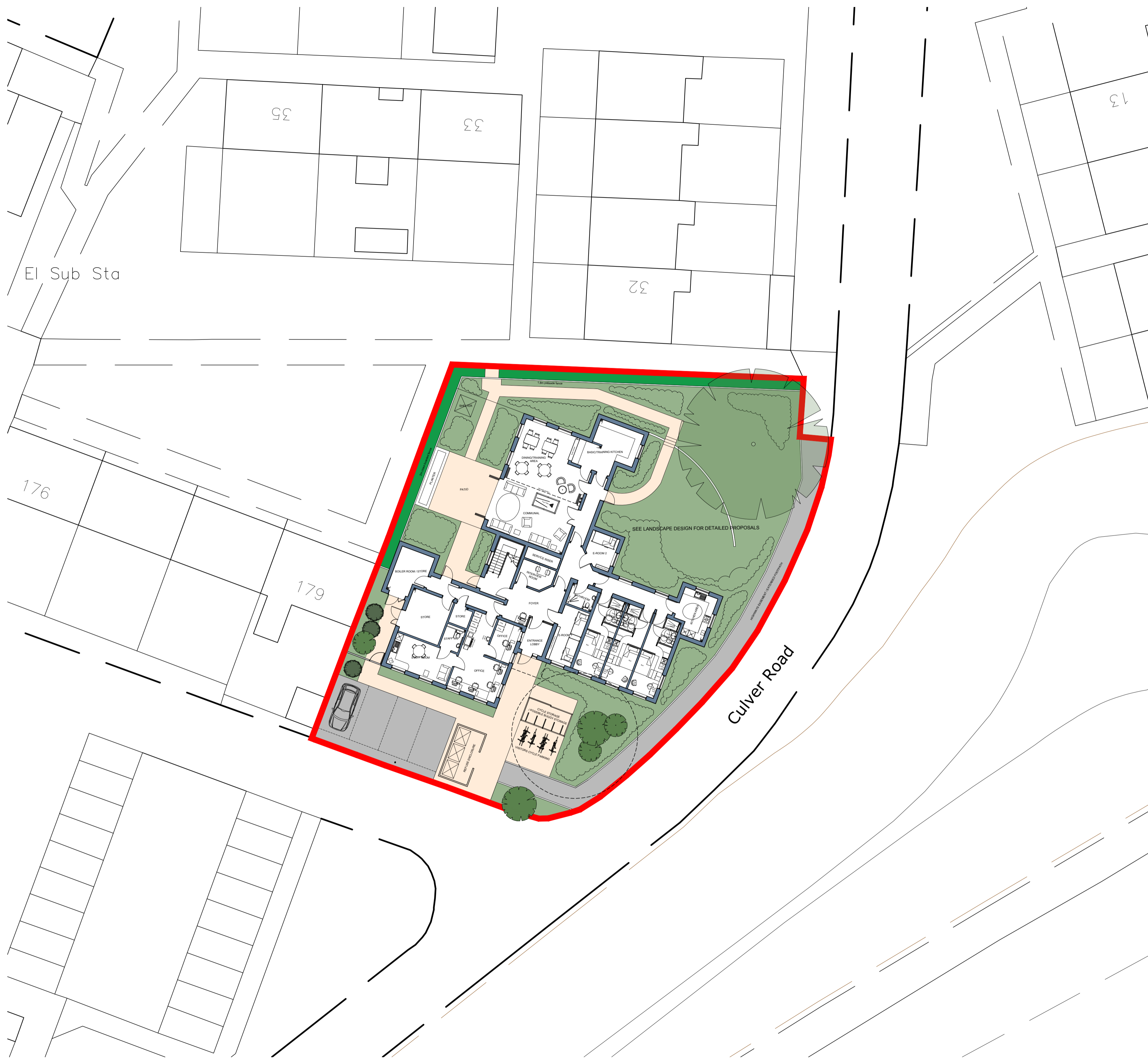
SITE PLAN Scale 1:200

GENERAL NOTES: 1. This drawing is the copyright of KSA Architects Ltd and may not be copied, altered or reproduced in any form or passed on to a third party without written consent. If in doubt ASK. 2. This drawing has been produced as a guide, and is subject to further detailed information being provided, including but not limited to a full topographical survey, service enquires and an arboriculture study.